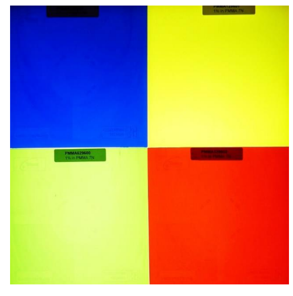
Tosaf's light-diffusing masterbatches ensure uniform illumination even with LED spotlights.